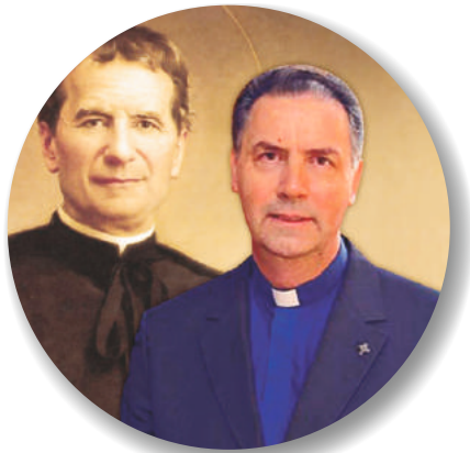
Fr Ángel Fernández Artime Rector Major of the Salesian Society

The Rector Major, the superior of the Salesian Society, is the successor of Don Bosco, the father and centre of unity of the Salesian Family. Fr Ángel Fernández Artime was elected by the General Chapter 27 as the new Rector Major of the Salesian Congregation and the 10th Successor of Don Bosco. He was born in August 21, 1960 in Luanco-Gozon, Asturias, Spain; ordained a priest on July 4, 1987, in León.