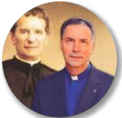
Fr Ángel Fernández Artime Rector Major of the Salesian Society

The Rector Major, the superior of the Salesian Society, is the successor of Don Bosco, the father and centre of unity of the Salesian Family. Fr Ángel Fernández Artime was elected by the General Chapter 27 as the new Rector Major of the Salesian Congregation and the 10th Successor of Don Bosco. He was born in August 21, 1960 in Luanco-Gozon, Asturias, Spain; ordained a priest on July 4, 1987, in León.