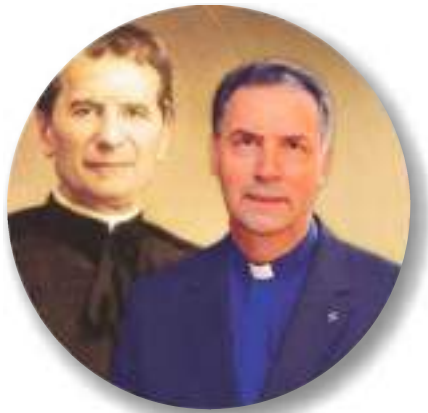
Fr Ángel Fernández Artime Rector Major of the Salesian Society

The Rector Major, the superior of the Salesian Society, is the successor of Don Bosco, the father and centre of unity of the Salesian Family. Fr Ángel Fernández Artime was elected by the General Chapter 27 as the new Rector Major of the Salesian Congregation and the 10th Successor of Don Bosco. He was born in August 21, 1960 in Luanco-Gozon, Asturias, Spain; ordained a priest on July 4, 1987, in León.