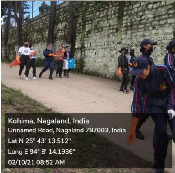
Kohima, Nagaland, India Unnamed Road, Nagaland 797003, India Lat N 25° 43' 13.512" Long E 94° 8' 14.1936" 02/10/21 08:52 AM