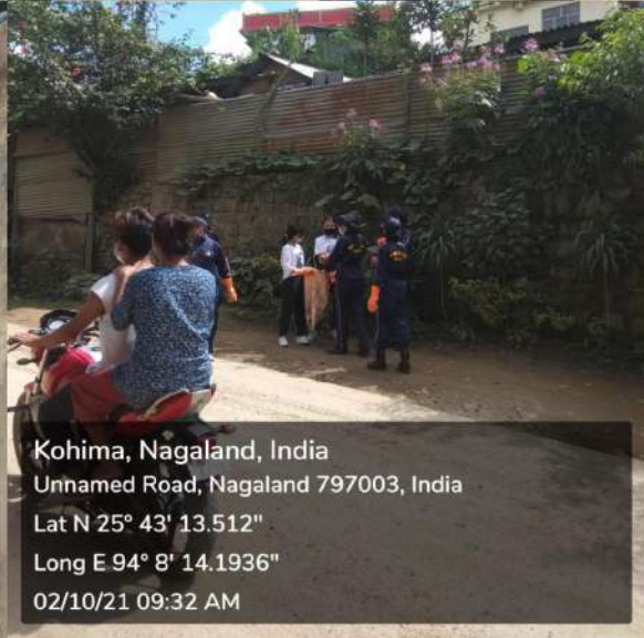
Kohima, Nagaland, India Unnamed Road, Nagaland 797003, India Lat N 25° 43' 13.512" Long E 94° 8' 14.1936" 02/10/21 09:32 AM