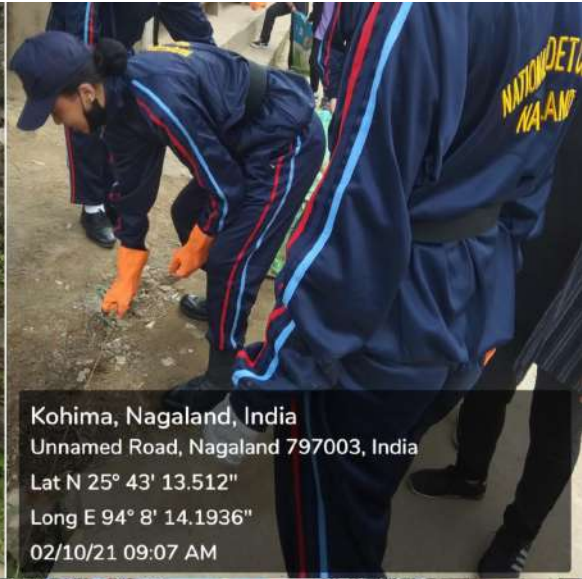
Kohima, Nagaland, India Unnamed Road, Nagaland 797003, India Lat N 25° 43' 13.512" Long E 94° 8' 14.1936" 02/10/21 09:07 AM