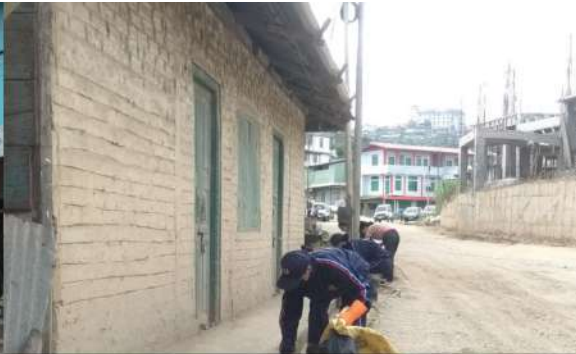
Kohima, Nagaland, India Unnamed Road, Nagaland 797003, India Lat N 25° 43' 13.512" Long E 94° 8' 14.1936" 02/10/21 09:03 AM