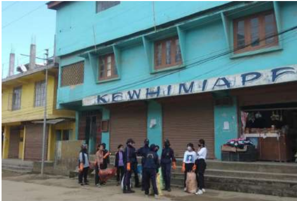
Kohima, Nagaland, India Unnamed Road, Nagaland 797003, India Lat N 25° 43' 13.512" Long E 94° 8' 14.1936" 02/10/21 09:25 AM