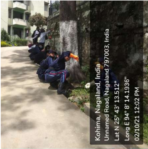
Kohima, Nagaland, India Unnamed Road, Nagaland 797003, India Lat N 25° 43' 13.512" Long E 94° 8' 14.1936" 02/10/21 12:02 PM