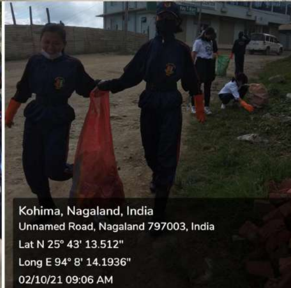
Kohima, Nagaland, India Unnamed Road, Nagaland 797003, India Lat N 25° 43' 13.512" Long E 94° 8' 14.1936" 02/10/21 09:06 AM