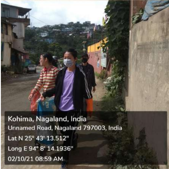
Kohima, Nagaland, India Unnamed Road, Nagaland 797003, India Lat N 25° 43' 13.512" Long E 94° 8' 14.1936" 02/10/21 08:59 AM