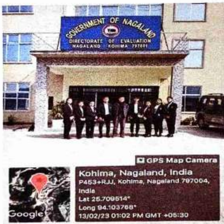
Directorate of Evaluation Nagaland