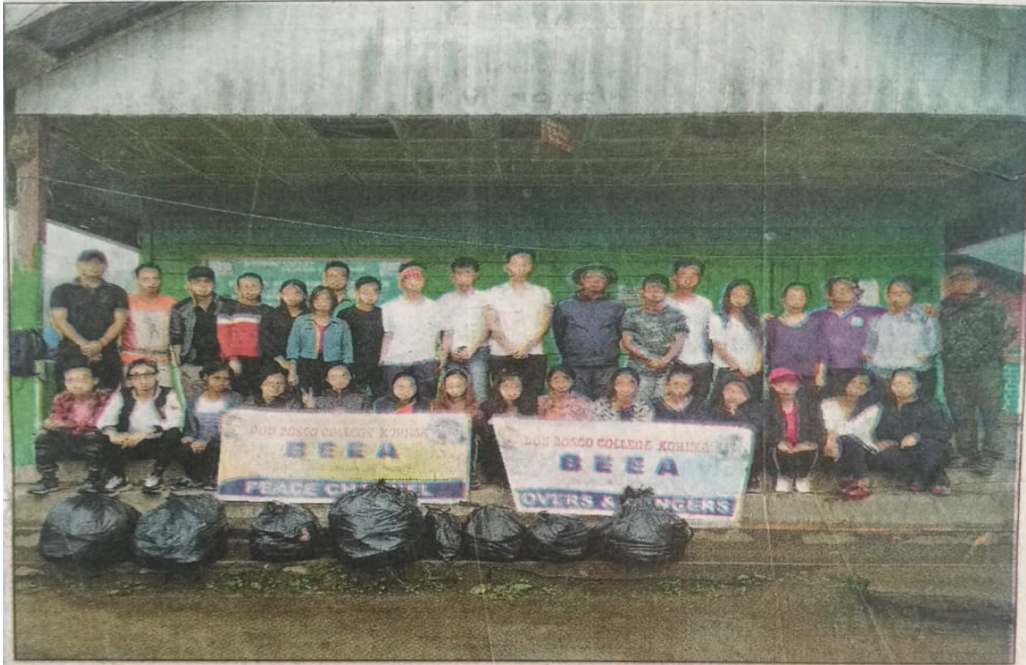
Peace Channel, Rovers & Rangers of DBCK at Dzükou valley.

DIMAPUR: Dzükou Valley has been declared as "Plastic Free Zone" by Southern Angami Youth Organisation (SAYO) on June 5, and as a follow-up initiative, Peace Channel (PC) and Rovers & Rangers of Don Bosco College Kohima (DBCK), as a part of their yearly programme, on August 31 carried out cleanliness drive at the valley.