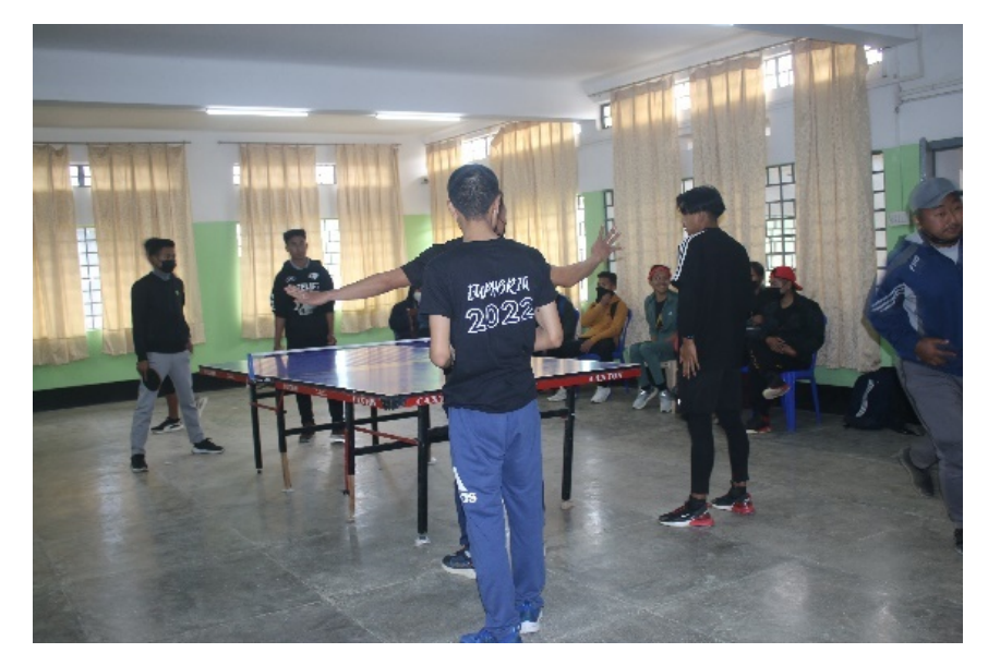
Report by Euphoria Committee