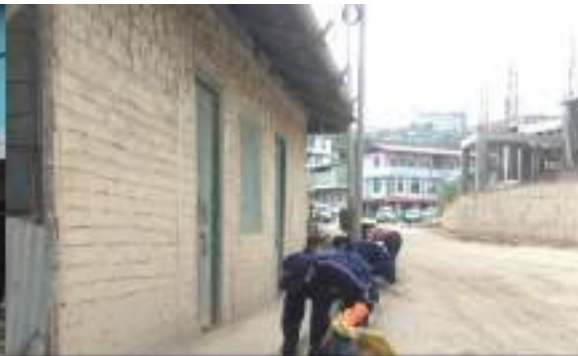
Kohima, Nagaland, India Unnamed Road, Nagaland 797003, India Lat N 25° 43' 13.512" Long E 94° 8' 14.1936" 02/10/21 09:03 AM