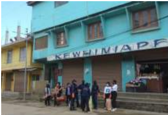
Kohima, Nagaland, India Unnamed Road, Nagaland 797003, India Lat N 25° 43' 13.512" Long E 94° 8' 14.1936" 02/10/21 09:25 AM