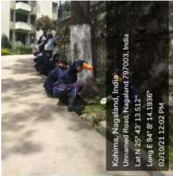
Kohima, Nagaland, India Unnamed Road, Nagaland 797003, India Lat N 25° 43' 13.512" Long E 94° 8' 14.1936" 02/10/21 12:02 PM