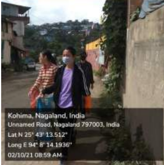
Kohima, Nagaland, India Unnamed Road, Nagaland 797003, India Lat N 25° 43' 13.512" Long E 94° 8' 14.1936" 02/10/21 08:59 AM