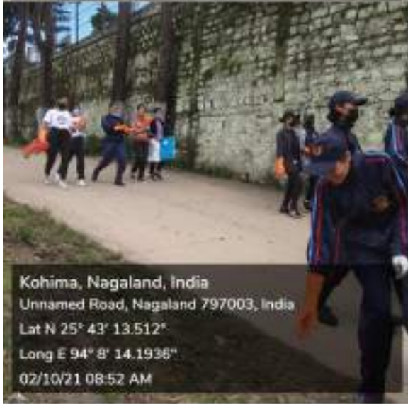
Kohima, Nagaland, India Unnamed Road, Nagaland 797003, India Lat N 25° 43' 13.512" Long E 94° 8' 14.1936" 02/10/21 08:52 AM