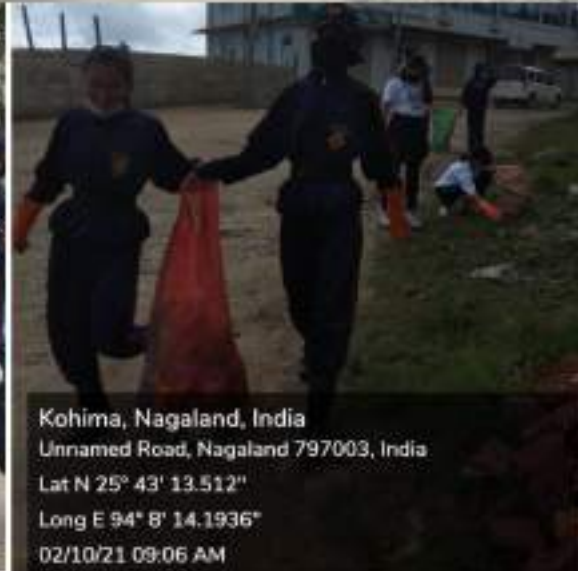
Kohima, Nagaland, India Unnamed Road, Nagaland 797003, India Lat N 25° 43' 13.512" Long E 94° 8' 14.1936" 02/10/21 09:06 AM