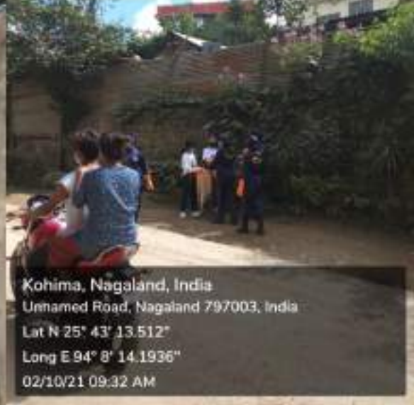
Kohima, Nagaland, India Unnamed Road, Nagaland 797003, India Lat N 25° 43' 13.512" Long E 94° 8' 14.1936" 02/10/21 09:32 AM