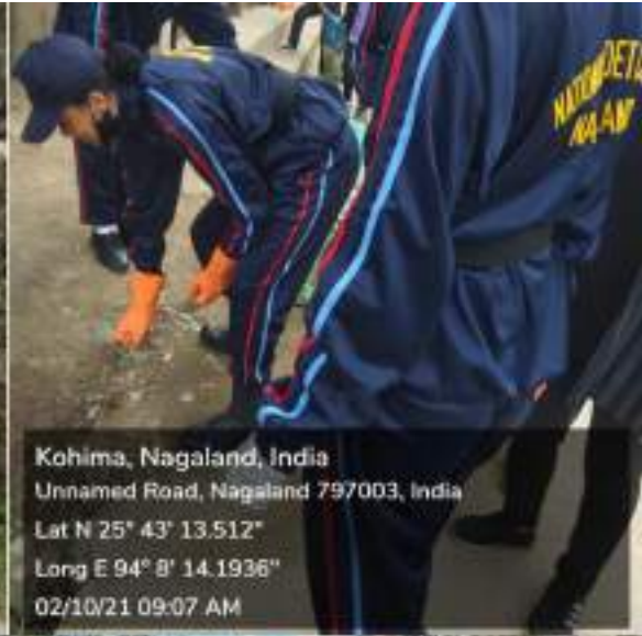
Kohima, Nagaland, India Unnamed Road, Nagaland 797003, India Lat N 25° 43' 13.512" Long E 94° 8' 14.1936" 02/10/21 09:07 AM