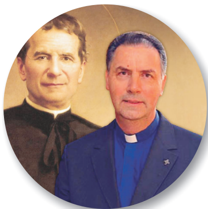
Fr Ángel Fernández Artime Rector Major of the Salesian Society

The Rector Major, the superior of the Salesian Society, is the successor of Don Bosco, the father and centre of unity of the Salesian Family. Fr Ángel Fernández Artime was elected by the General Chapter 27 as the new Rector Major of the Salesian Congregation and the 10th Successor of Don Bosco. He was born in August 21, 1960 in Luanco-Gozon, Asturias, Spain; ordained a priest on July 4, 1987, in León.